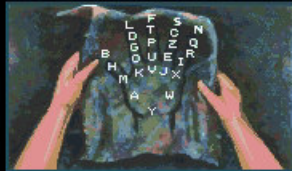
DRUID HAND CODE